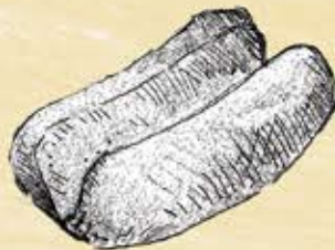
Hot dog bun